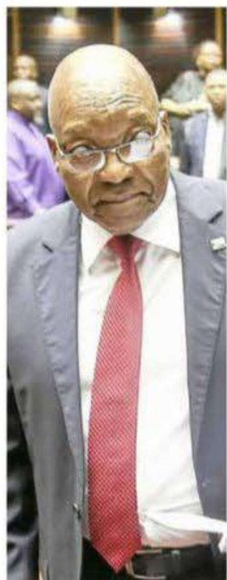
FORMER president Jacob Zuma.